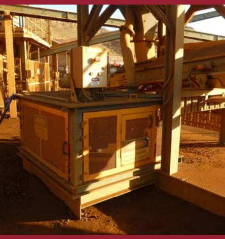
Consep Rotary Sample Collectors